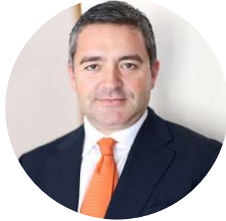
H.E. Blendi Klosi Minister of Tourism & Environment Albania