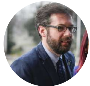
Hajrulla Çeku Deputy Minister Ministry of Tourism & Environment Albania